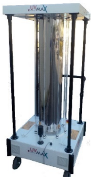
UV-MAX STANDARD HEIGHT