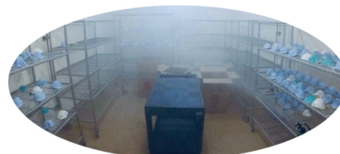
Fogging PPE Equipment