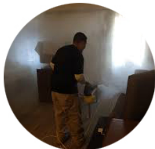
Fogging Guest/Patient Room