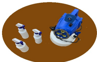
Foggers and Spray Bottles