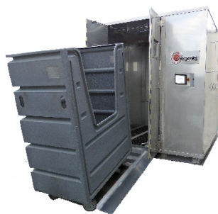
Energenics Quick Kill Kartwasher