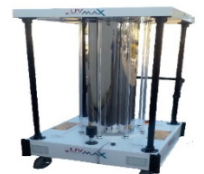
UV-MAX LOW PROFILE