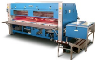
Skyline SP Series

If multi-bar storage in each lane is not required, consult a Chicago professional for information about Aircumulator Solo —the Chicago single bar accumulator system. If the flexibility to fold and stack small pieces, as well as stack only unfolded small pieces is required, the Skyline SP folding/stacking series should be considered. Consult Chicago Skyline brochure #7524 or Skyline SP brochure #7525 for details. Aircumulator may also be built into a new Chicago Skyline large piece folder as original equipment if the flexibility to fold large and small pieces, as well as the ability to stack small pieces is required.