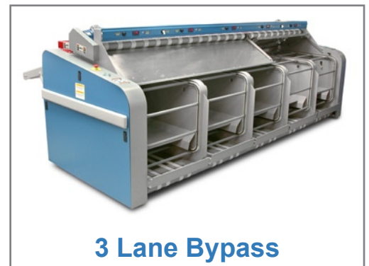
3 Lane Bypass

An optional Multi-Lane Bypass Section can be moved into position over the storage bar area of the Aircumulator Carousel to allow bypass of the accumulating function and discharge of unstacked pieces to a rear table while other lanes may stack items onto multiple storage bars in each lane.