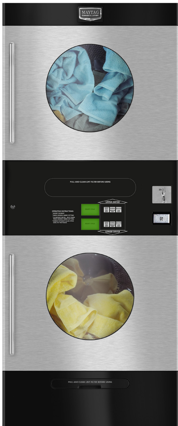
Shown in Stainless Steel.