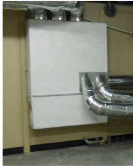
AF-4 (FM) Interior Flat Mount