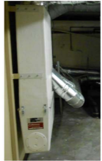
AF-4 (FM) Interior Flat Mount