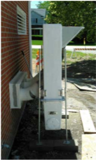
AF-4 (FM) Exterior Flat Mount