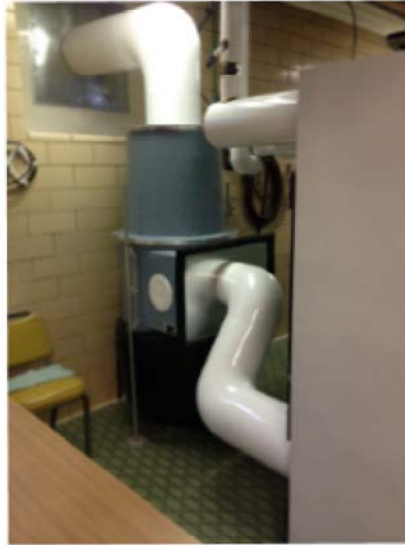
AF-4 (STD) Interior Installed