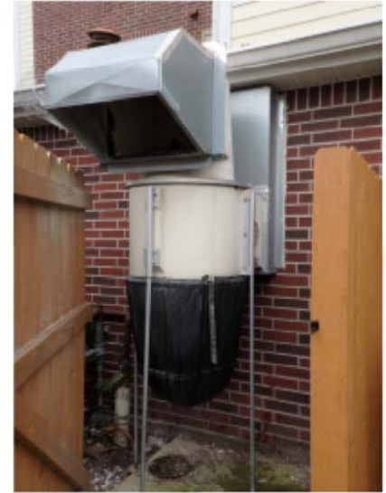
AF-3 (STD) Exterior Installed