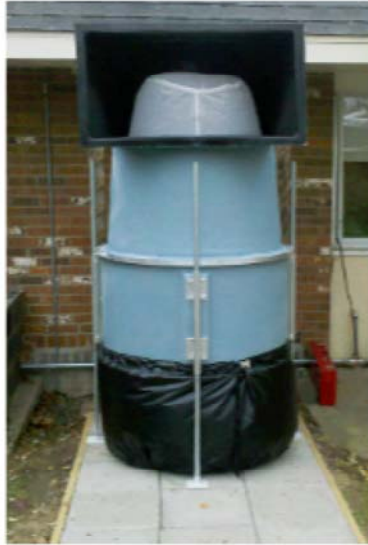
AF-7 (STD) Exterior Installed