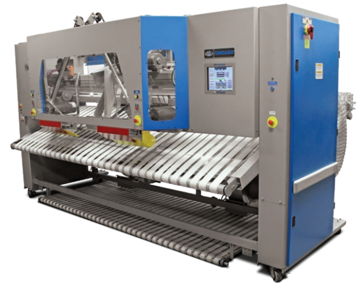
Bypass Conveyor In Raised Position For Use